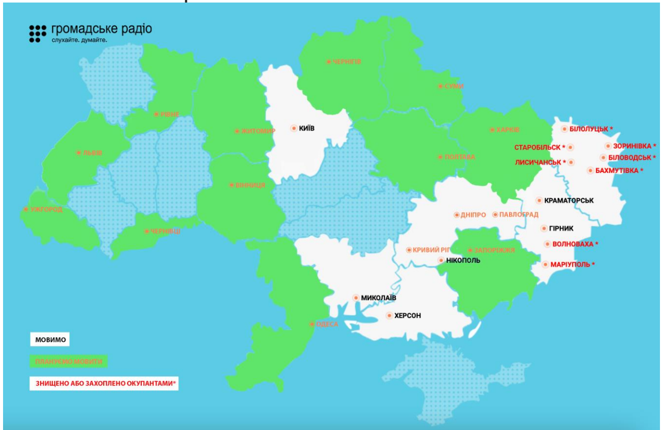
Picture 2. Planned development of the Hromadske Radio network in 2024-25.

Broadcasting in such cities gives the company the funds to broadcast in essential places like Hirnyk, Kramatorsk, Mykolaiv, Nikopol, and Kherson. For example, Hromadske Radio started broadcasting in Kherson within days of receiving a temporary permit. It was possible due to the advertising funds and the pre-arranged transmitter purchase.